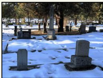
Kelowna Pioneer Cemetery

Applebox Belles: The Women of Lake Country's Packinghouses, Community Stories, Lake Country Museum & Archives