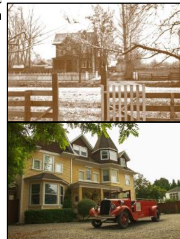
The Renwick House

The Trophy Den is located at 987 Lawrence Ave, Kelowna, BC V1Y 6M3. Phone: 250-861-4747. Email: info@thetrophyden.com . Website: www.thetrophyden.com