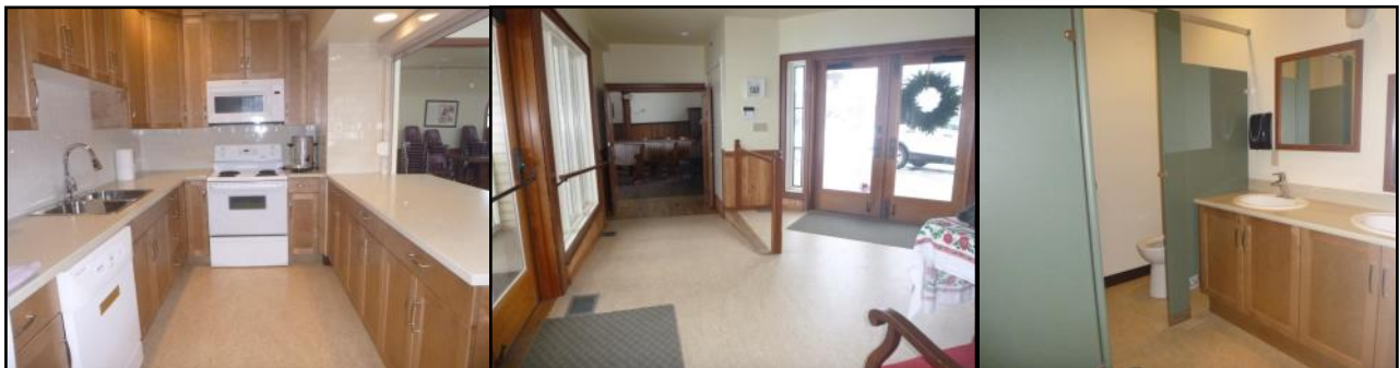
Benvoulin Church common area renovations

"Benvoulin Heritage Church and Reid Hall continue to be gathering places for the community."