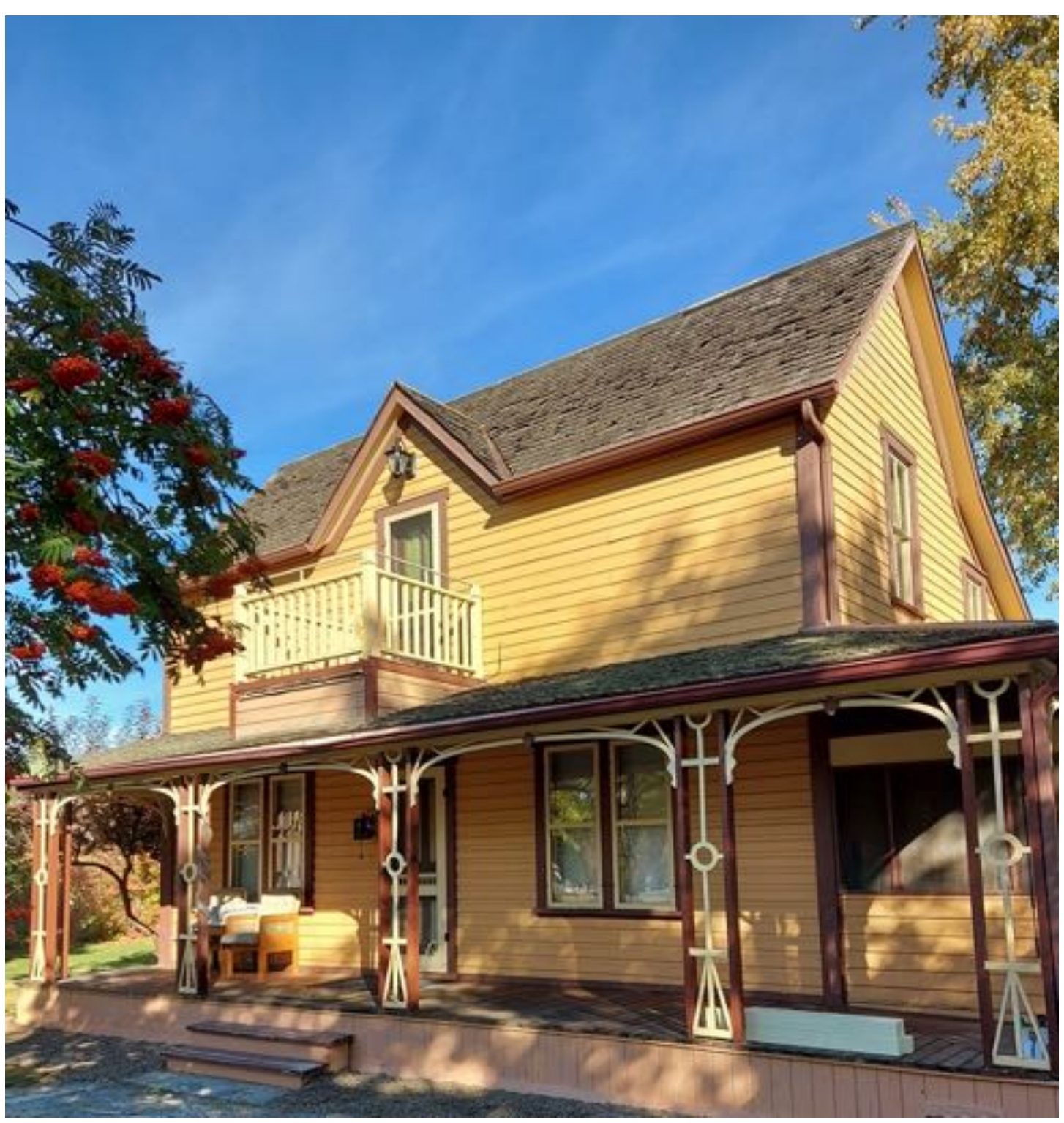
McIver House - home to our building and property caretaker

An offer of a heritage farmhouse by the McIver family provided another undertaking for the Society. Built in the early 1900's, it was a disappearing example of the early farmhouses found in eastern Canada. The move from 1954 KLO Road and restoration on the Benvoulin site was completed in the mid 1990's. Its life continues as the caretaker's residence for the Benvoulin Heritage Park.