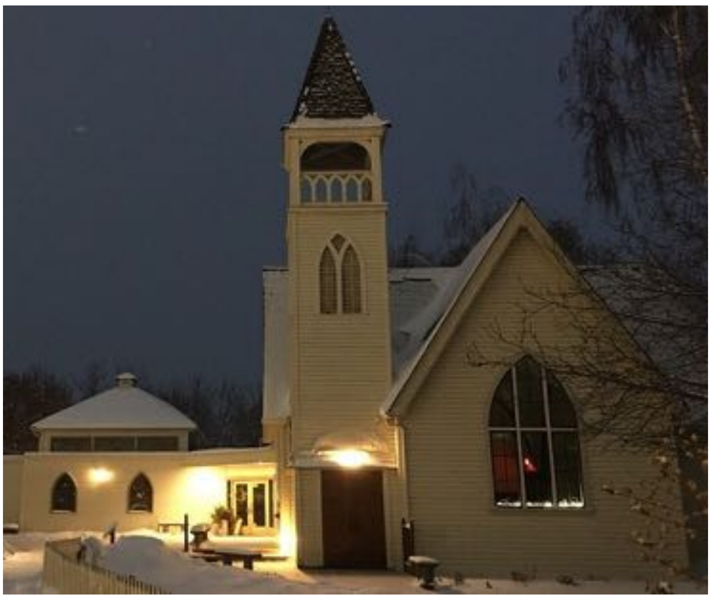
Beautiful night photograph by Percy Lujan, our building and park caretaker