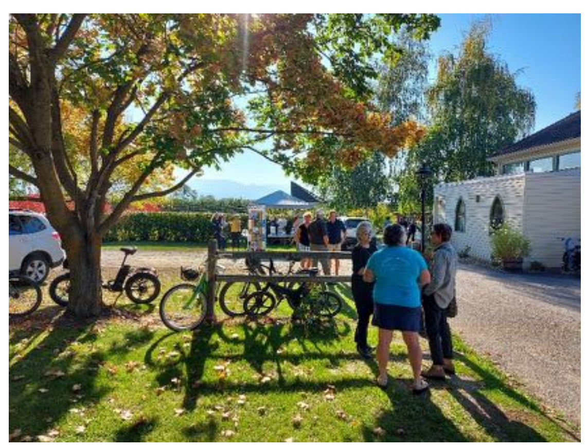
Celebrating our newly renovated gardens – Thank you Okanagan Master Gardeners!