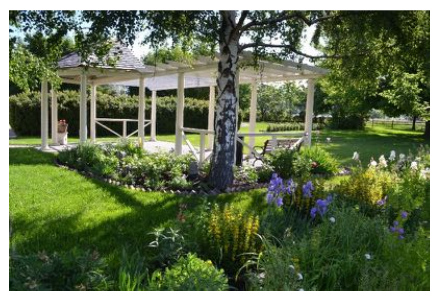
Benvoulin Heritage Park

We are also celebrating the first phase of the reconstruction of our gardens at Benvoulin Heritage Park. Thanks to our Garden Committee and the Okanagan Master Gardeners the irrigation, lighting and gardens are taking on a whole new look!