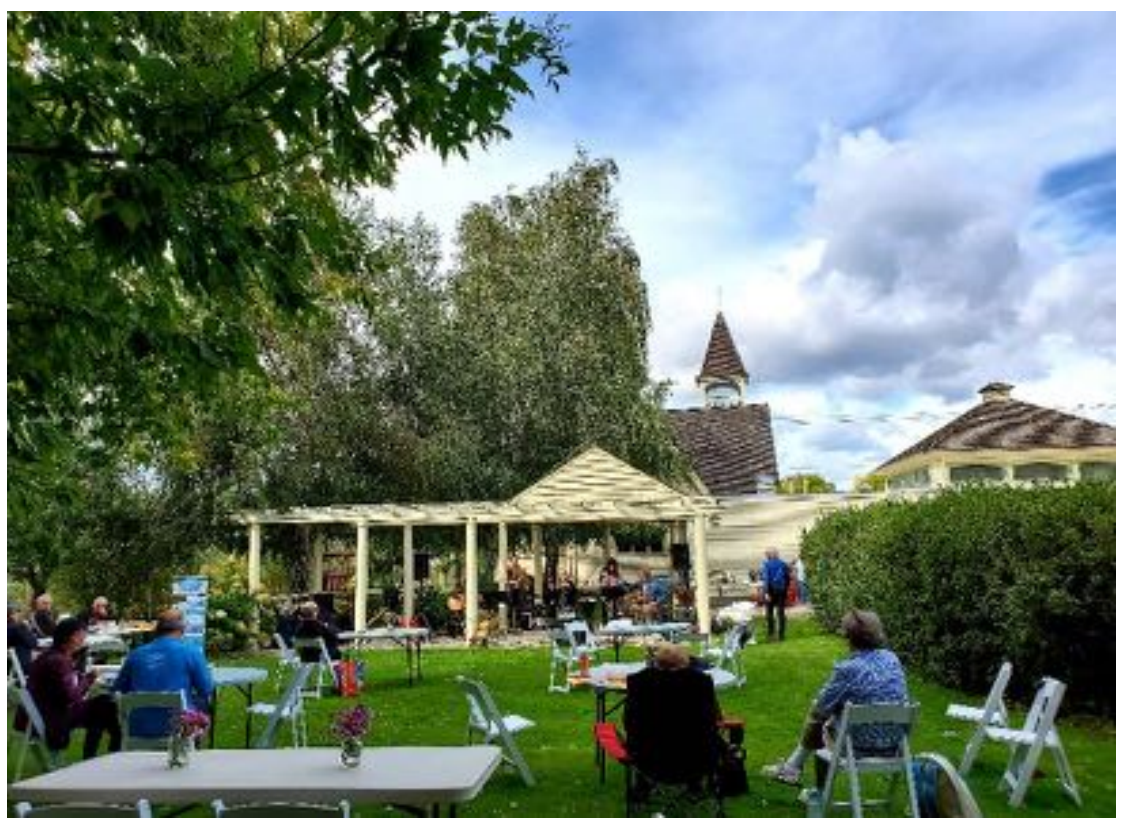
Picnic in the park with art and music by 'October Sky'